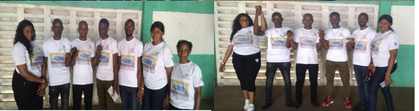
MISL Monthly Results Report April, 2024 (Impacting Life. Prescribing Hope)